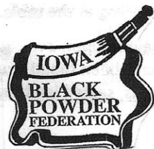
TABLE SHOOTING MATCHES

Raccoon Valley Muzzleloaders Range 1430 Jordan Avenue, Jefferson, IA 50129